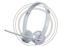
Lenovo 110 Stereo USB Headset