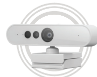
Lenovo 510 FHD Webcam