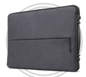
Lenovo Urban Sleeve Case