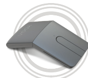
Lenovo Yoga Mouse with Laser Presenter