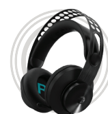
Lenovo H300 Stereo Gaming Headset