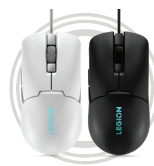
Lenovo M300s RGB Gaming Mouse