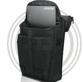
Lenovo Active Gaming Backpack