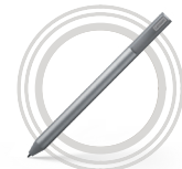
Lenovo USI Pen