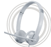
Lenovo 110 Stereo USB Headset