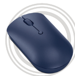
Lenovo 540 USB-C Wireless Mouse