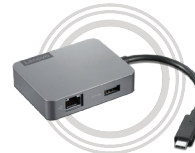
Lenovo USB-C Travel Hub Gen 2