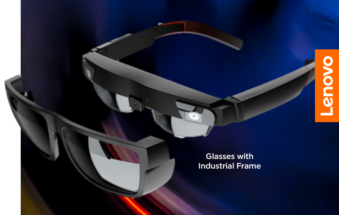
Glasses with Industrial Frame

The ThinkReality A3 is one of the most advanced and versatile enterprise smart glasses to come to market and is part of a comprehensive digital solutions offering from Lenovo.