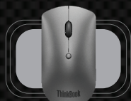
Lenovo Bluetooth® Silent Mouse