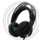
Legion H300 Stereo Gaming Headset