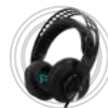
Legion H300 Stereo Gaming Headset