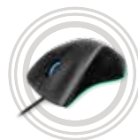
Lenovo Legion M500 RGB Gaming Mouse