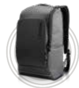
Lenovo Legion 15.6" Recon Gaming Backpack

* Example of Lenovo Legion catalogue naming convention