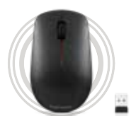
Lenovo 520 Wireless Mouse