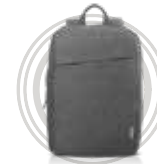
Lenovo 15.6" Laptop Casual Backpack B210