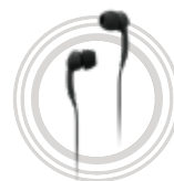
Lenovo 100 In-Ear Headphone