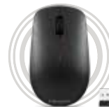
Lenovo 400 Wireless Mouse