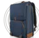
Lenovo 15.6" Laptop Urban Backpack B810